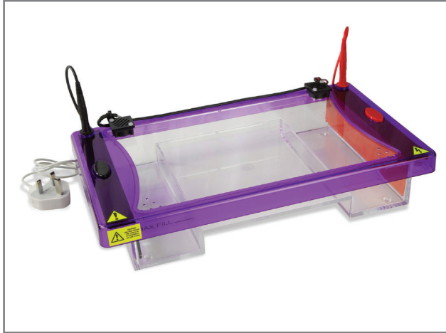
Condensation free lids available